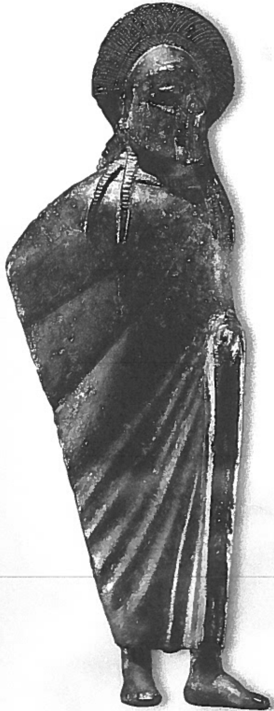
This bronze statue is of a Spartan soldier.

Women and Slaves In Athens, women and slaves had far fewer rights than men had. Spartan women had more rights than other Greek women, such as owning property.