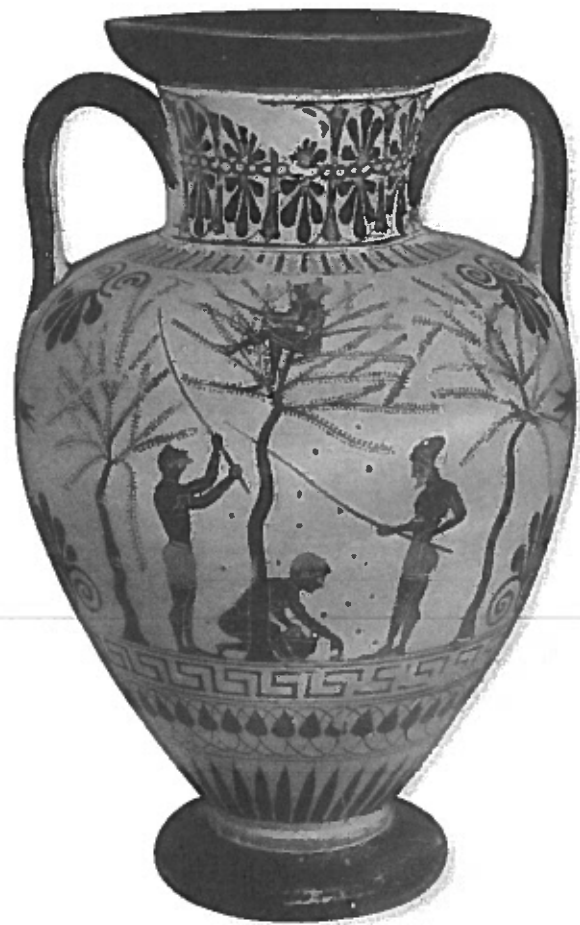
The art on this graceful Athenian jar shows the harvesting of olives.

Even a casual visitor would have noticed that Athens and Sparta were very different. Let's take a closer look at the way people lived in these two city-states. We will examine each city's government, economy, education, and treatment of women and slaves to discover how they differed.